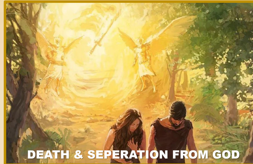
DEATH & SEPERATION FROM GOD

When the woman saw that the fruit of the tree was good for food and pleasing to the eye, and also desirable for gaining wisdom, she took some and ate it. She also gave some to her husband, who was with her, and he ate it. Then the eyes of both of them were opened, and they realized they were naked; so they sewed fig leaves together and made coverings for themselves. – Genesis 3:6-7 NIV